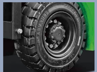
Standard rubber tread tires